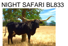
NIGHT SAFARI BL833