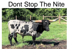
Dont Stop The Nite