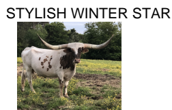
STYLISH WINTER STAR