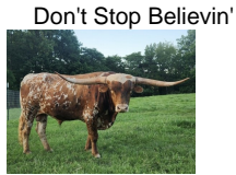
Don't Stop Believin'