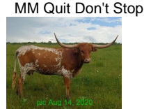
MM Quit Don't Stop